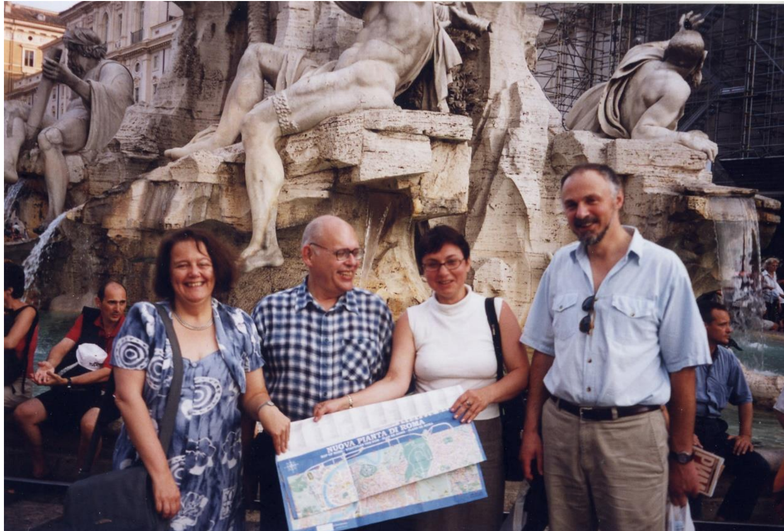
Rome, Trevi Fontana, July 7-13, 2003