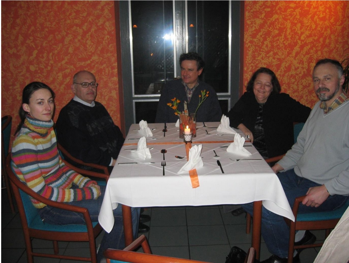
• Rostock, March 11, 2004